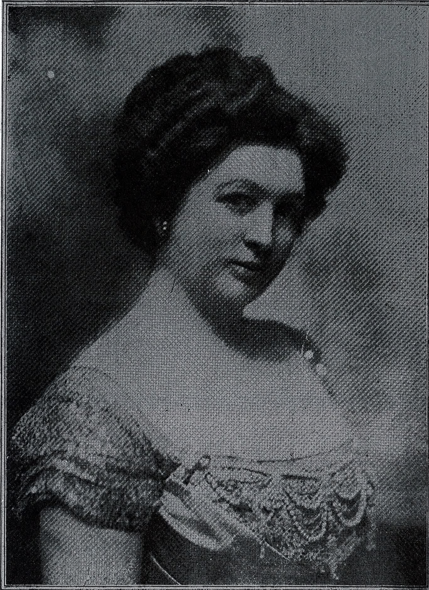
Australia's Famous Contralto