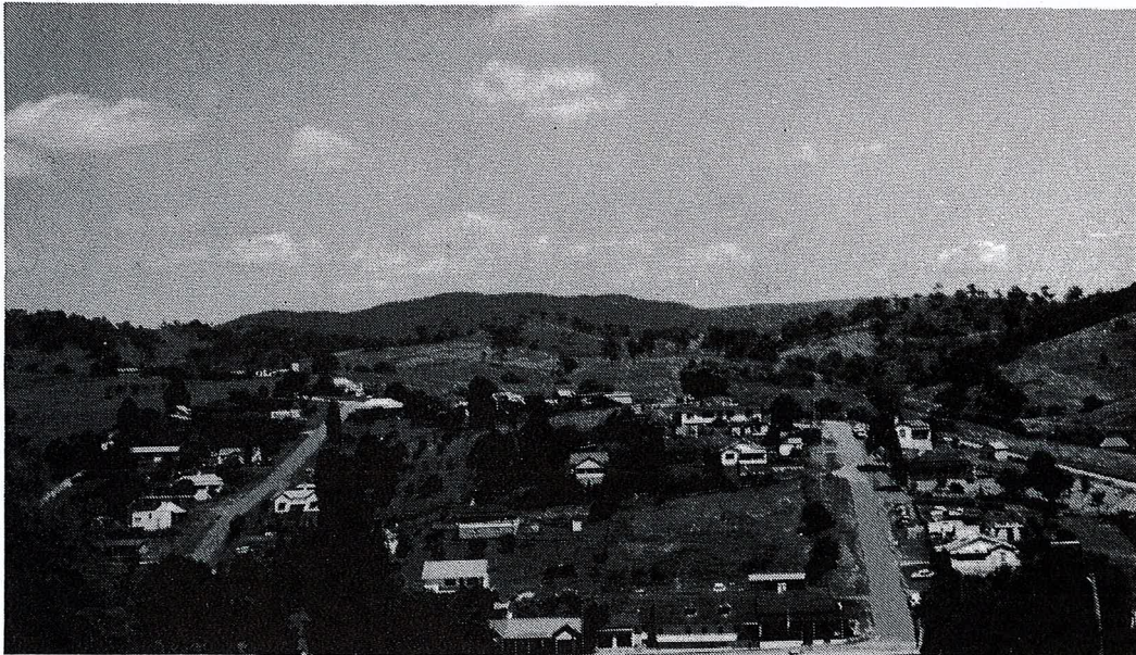
Looking towards the former "Mantlehill" at Candelo.