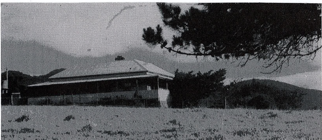
"Tarlintonville", Dry River.