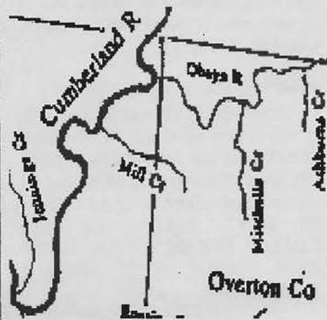
Map shows Mill Creek in Jackson and Overton Counties, Tennessee