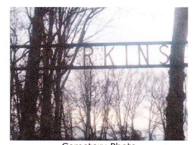
Cemetery Photo Added by: <u>Aaron Clouse</u>

Add a photo for this person of the photo A Photo The scaled. Click on image for full size.