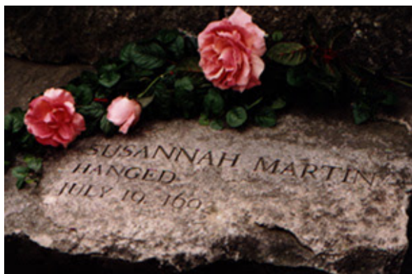
Memorial Stone, Salem, MA