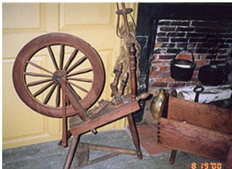
Susannah (North) Martin's Cradle & Spinning Wheel on display at the Macy/Colby House, Amesbury, MA