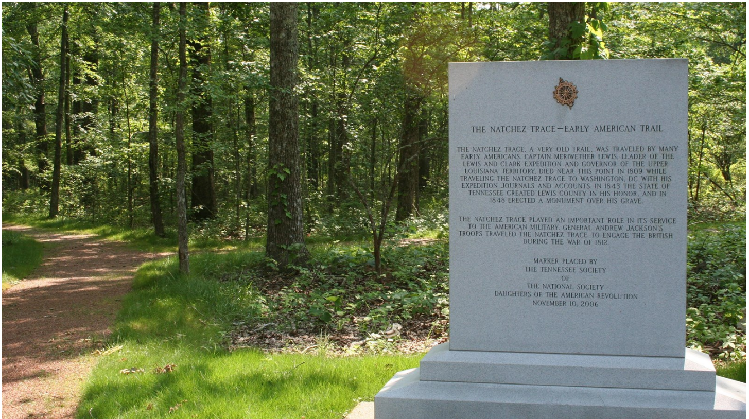
DAR marker at the Meriwether Lewis Site NPS

Natchez Trace Parkway ( https://www.nps.gov/natr/ )